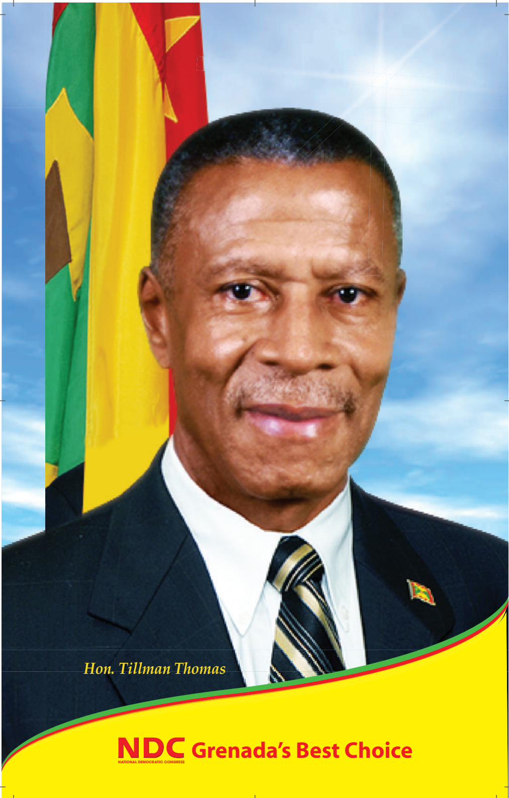
Hon. Tillman Thomas